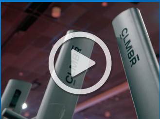
VIDEO PACKAGE EXAMPLE